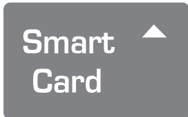
Banking ATM Card